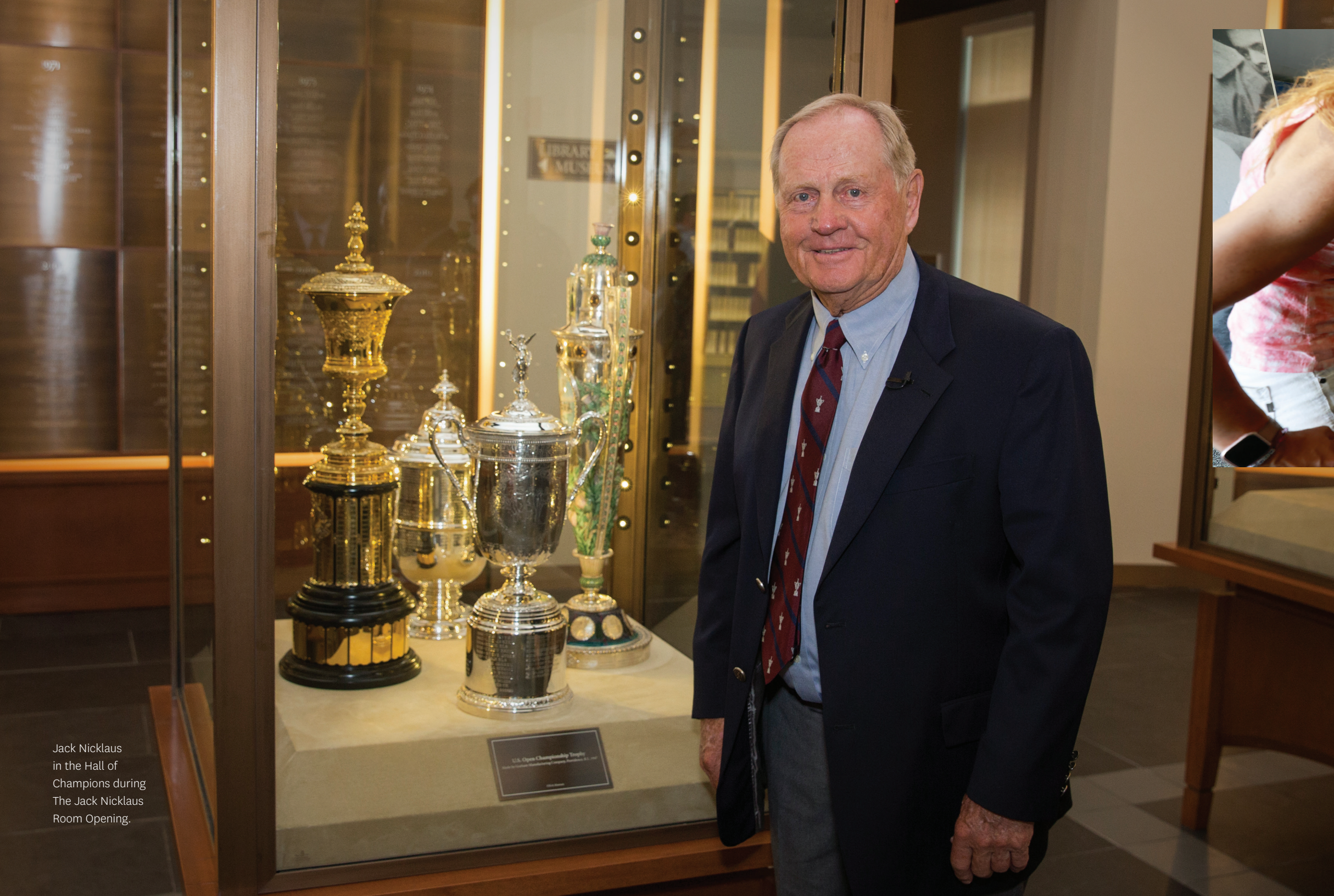
Jack Nicklaus in the Hall of Champions during The Jack Nicklaus Room Opening.