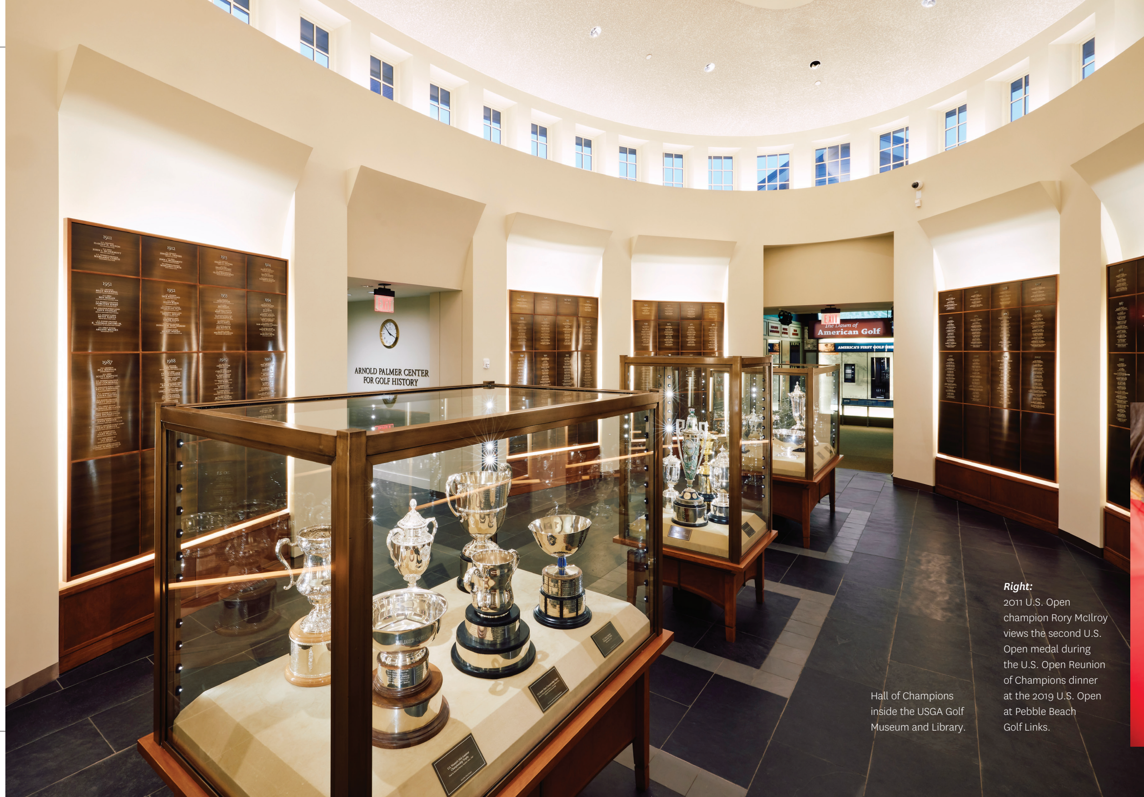
Hall of Champions inside the USGA Golf Museum and Library.

When the Museum cannot acquire an artifact, it is lost to private hands, at home and abroad.