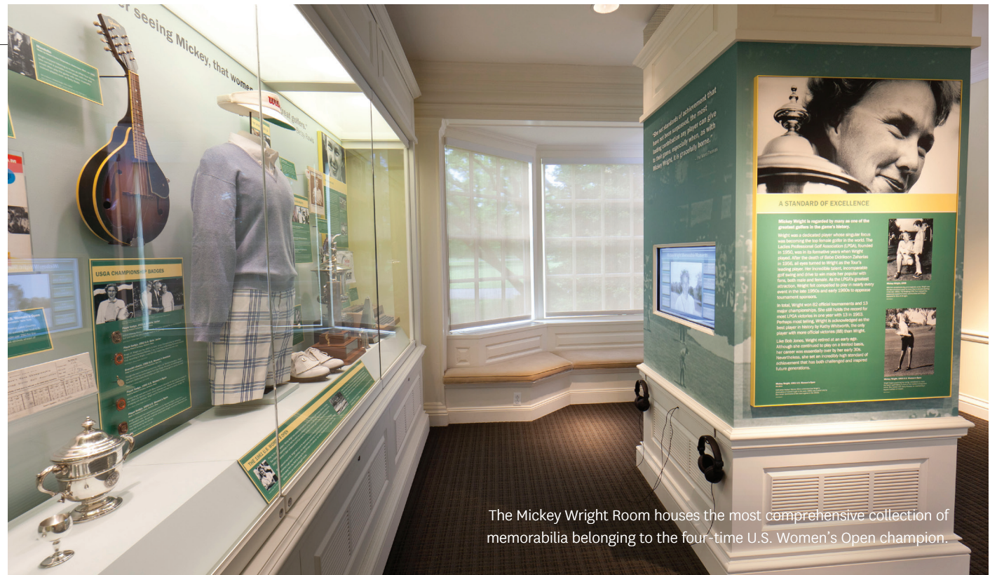
The Mickey Wright Room houses the most comprehensive collection of memorabilia belonging to the four-time U.S. Women's Open champion.

When you give to the USGA, you become part of a community of supporters who care deeply about the history of the game and want to see the USGA Golf Museum and Library flourish for generations to come. Your donation is an investment in golf's future allowing the USGA to develop and grow programs and initiatives that celebrate the history of the USGA and the game. The USGA is committed to engaging its supporters to help strengthen and expand the USGA's impact.