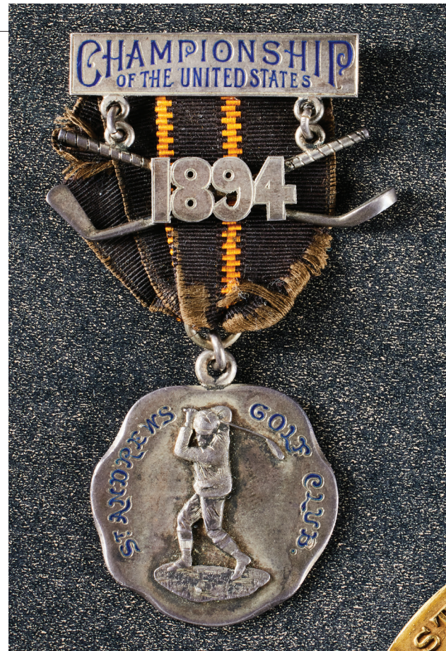
Left: Runner-up medal, 1894 Championship of the United States.

With a record-tying four U.S. Women's Open titles along with 82 professional victories, Mickey Wright is indelibly important to the USGA and the world of golf. After winning her first U.S. Women's Open in 1958, Wright became the first woman to defend her title when she defeated two-time champion and LPGA founder Louise Suggs in 1959 at Churchill Valley Country Club in Pittsburgh, Pa. Although the museum has a