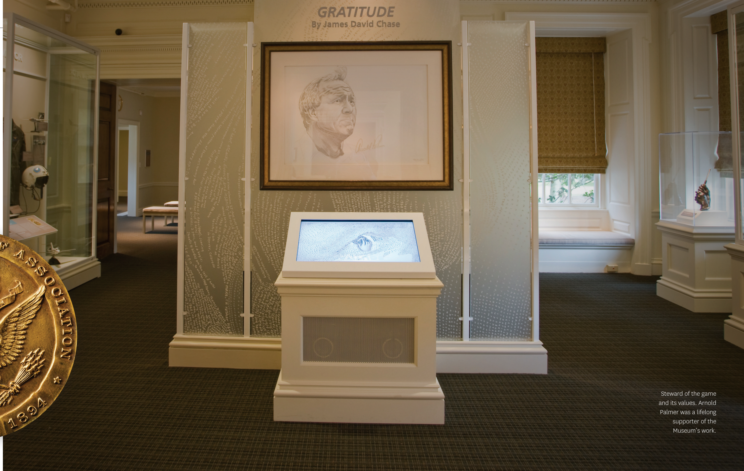
Steward of the game and its values. Arnold Palmer was a lifelong supporter of the Museum's work.