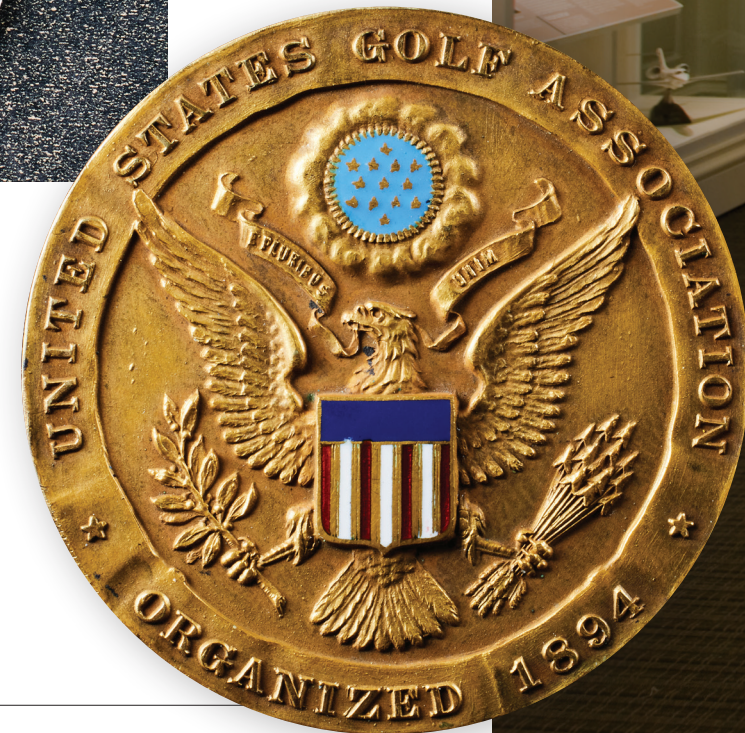
Below: Mickey Wright's Champion Medal, 1959 U.S. Women's Open.

comprehensive collection that spans Wright's personal life and professional career and a room is dedicated to her, this is the only USGA medal awarded to the legendary golfer in the museum's collection. The museum was able to purchase the medal thanks in part to funds provided by another generous donor.