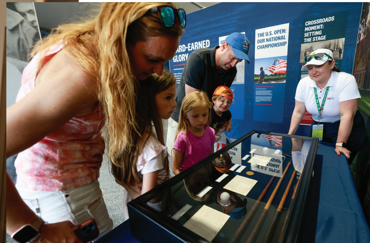
Left: A display inside the USGA Museum Experience at the 2022 U.S. Open at The Country Club in Brookline, Mass.