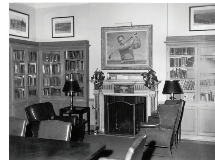
Top: The first galleries of the USGA Museum as it existed in New York City in the early 1960s.