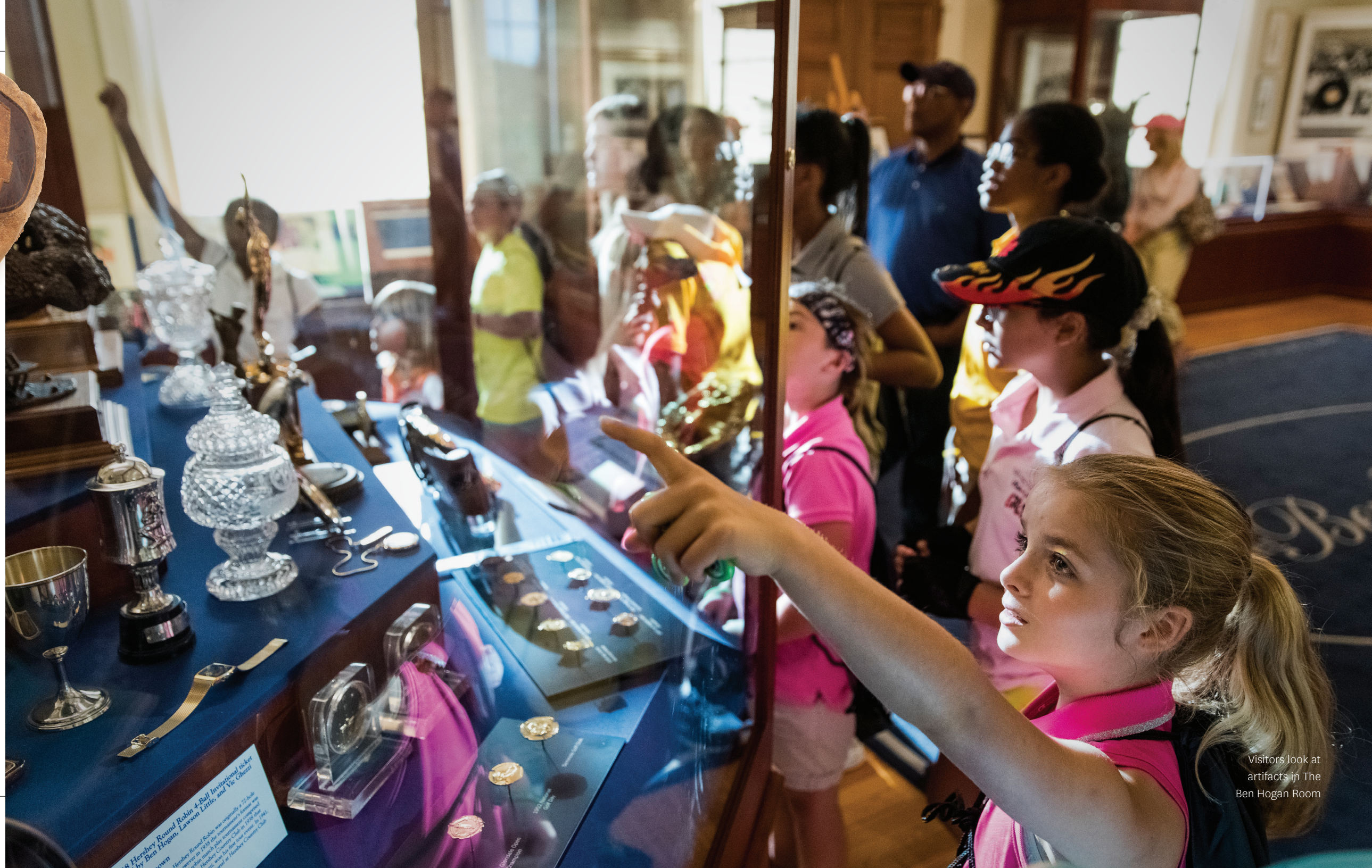
Visitors look at artifacts in The Ben Hogan Room