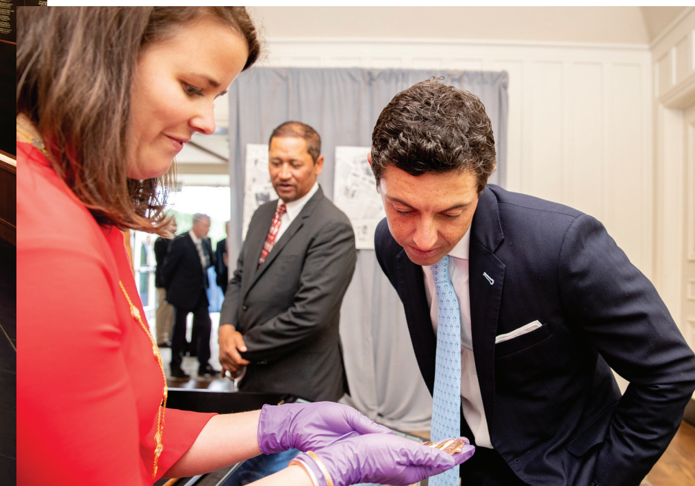
Right: 2011 U.S. Open champion Rory McIlroy views the second U.S. Open medal during the U.S. Open Reunion of Champions dinner at the 2019 U.S. Open at Pebble Beach Golf Links.

The USGA has established a Matching Gift Campaign for supporters of the USGA Golf Museum and Library. The USGA will match any endowed gift made to the USGA Golf Museum and Library, dollar for dollar, up to $500,000 per year, before December 31, 2024.