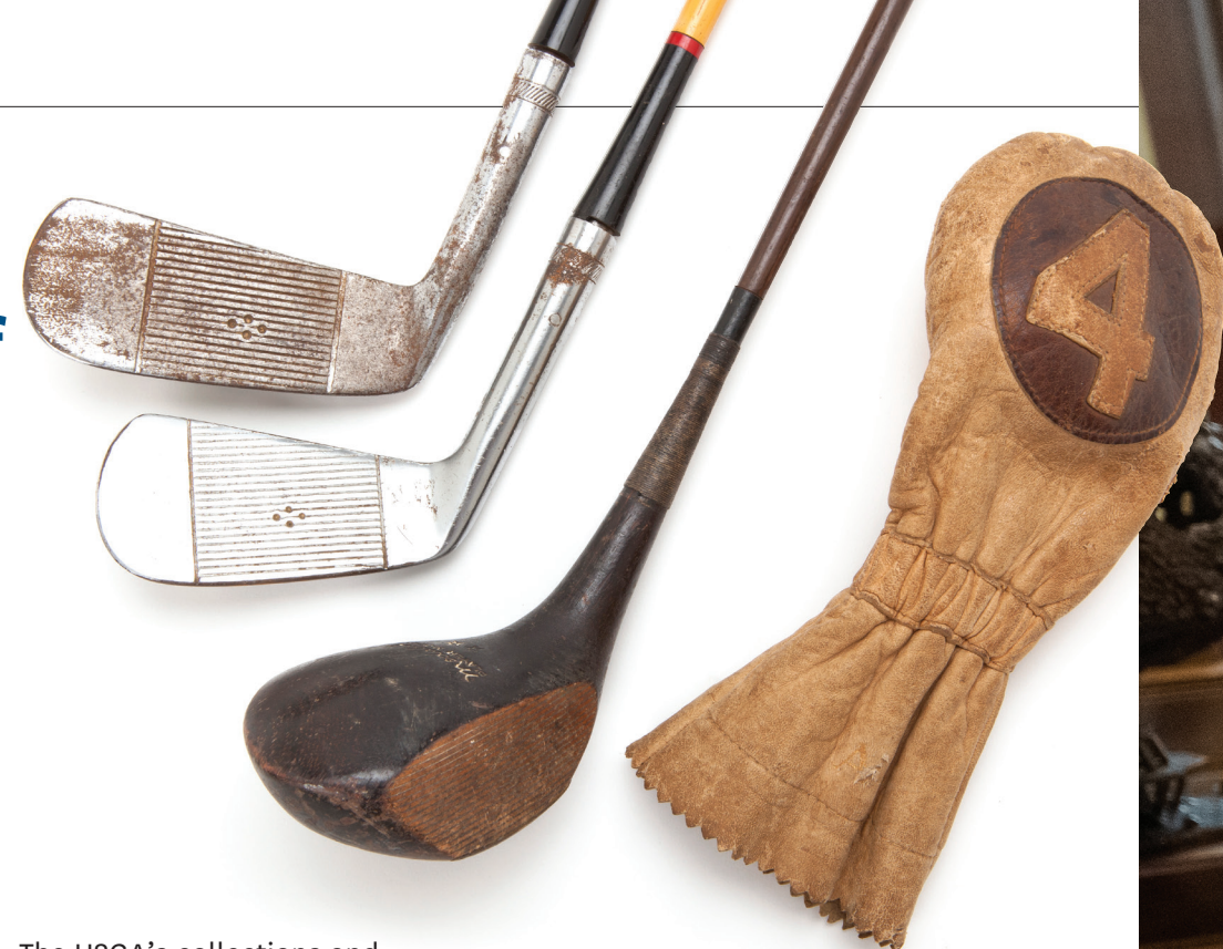
Above: Golf clubs and headcover belonging to Amelia Earhart, ca. 1930

The USGA requires sufficient resources to acquire and showcase its collections to sustain its worldwide leadership in golf history.